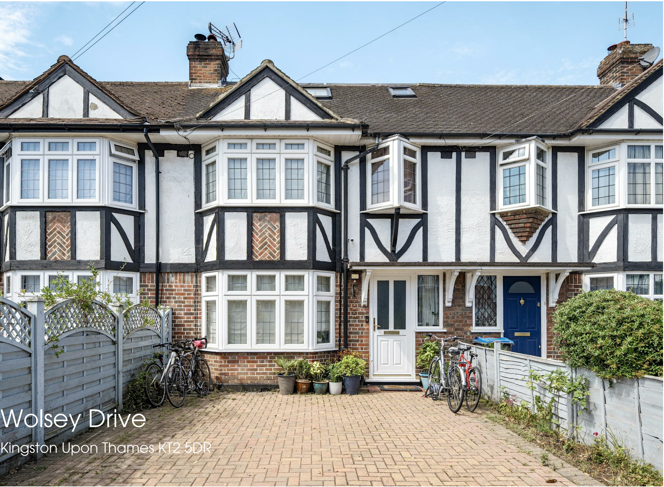
Wolsey Drive Kingston Upon Thames KT2 5DR